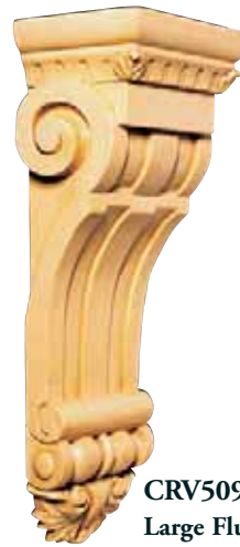
CRV5092 Large Fluted 9" x 24" x 7"