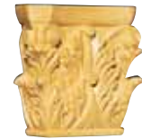
CRV5136 3 1/4" x 3 1/4" x 1 1/4" accepts up to 2" x 7/8" sold 2/ card