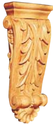
CRV5120 Large Acanthus with Shell 6" x 14" x 2 1/2"