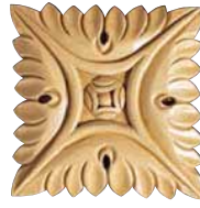
CRV5160 Lg Square Rosette 5" sq. x 5/8" sold 2/card