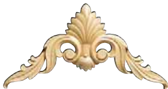
CRV5073 Large Plume Corner 12" x 12" x 13/16"