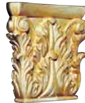
CRV5133 6" x 6" x 1 3/8" accepts up to 4" x 7/8"