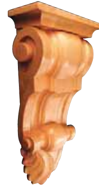
CRV5238 Medium Fluted 7 3/4" x 14" x 3"