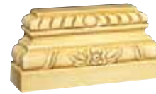
CRV5149 6 1/4" x 3" x 1 7/8" accepts up to 4" x 7/8"