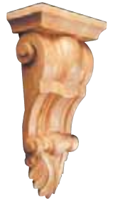
CRV5240 Small Fluted 5 1/2" x 10" x 2 1/2"

Slight variations occur during the handcarving process.