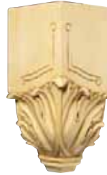
CRV5095 Large Crown Block 5 1/2" sq. x 12 1/8" Generally accepts crowns 5 1/4" - 7 1/2" wide