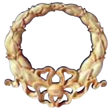
CRV5053 Laurel Center 8" x 8 1/4" x 3/4"