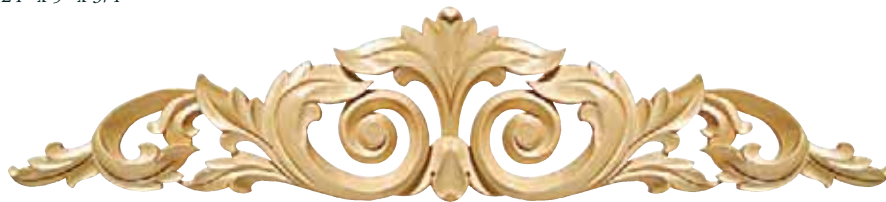
CRV5046 Large Acanthus with Scrolls - 36" x 7 1/2" x 7/8"