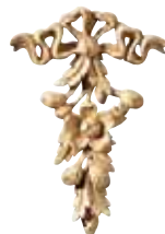
CRV5089 Small Floral Drop 5 1/2" x 8" x 1"