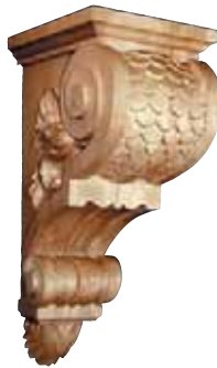
CRV5230 Large Imbricated Bracket Corbel 6" x 15" x 9"