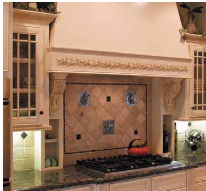
SOFT SENSATIONS - CM8820, CRV5110, PM8535, PM535, CRV5030