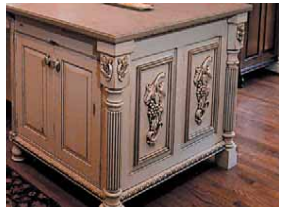
AN ISLAND RETREAT - PM8535, CRV5038, CRV5026