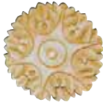
CRV5096 Med Round Rosette 3" x 3/8" sold 2/card