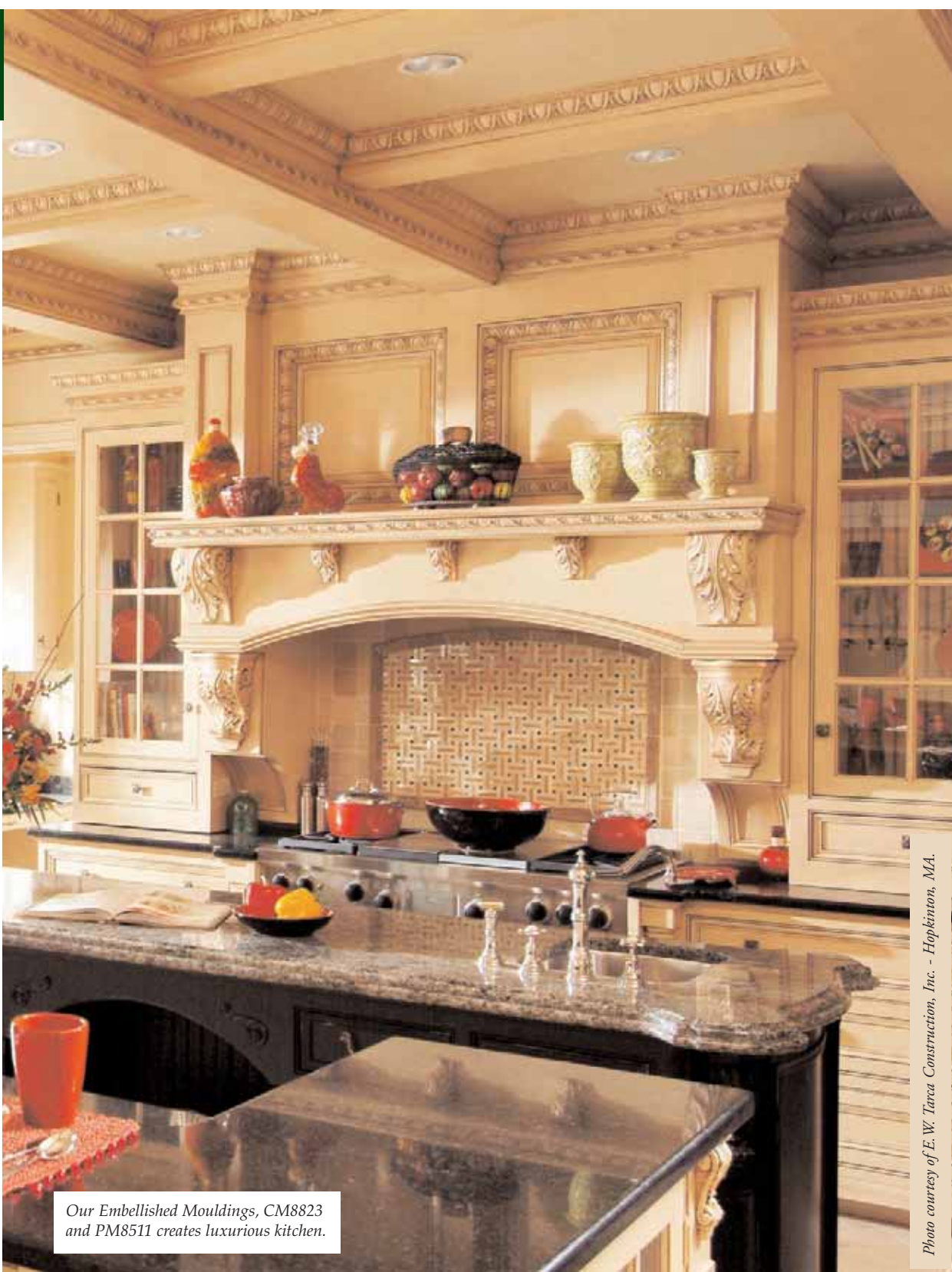
Our Embellished Mouldings, CM8823 and PM8511 creates luxurious kitchen.