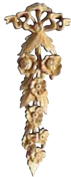
CRV5087 Large Floral Drop 5 1/2" x 14" x 1"

carvings are subject to design enhancements