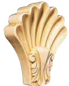
CRV5127 Shell Keystone 8" x 9 1/2" x 2 1/2" Generally accepts casings up to 6 1/2" x 1 7/8" wide