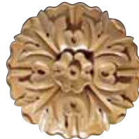
CRV5169 Med Round Rosette 3 1/2" x 5/8" sold 2/card