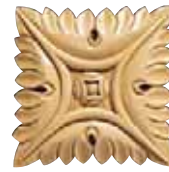
CRV5164 Med Square Rosette 3 1/2" sq. x 3/8" sold 2/card

Slight variations occur during the hand carving process.