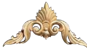
CRV5074 Medium Plume Corner 8" x 8" x 13/16"