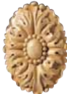
CRV5178 Med. Oval Rosette 3 1/2" x 5" x 3/4" sold 2/card