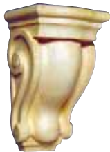
CRV5107 Classic 3 3/4" x 6 1/2" x 3 1/2"