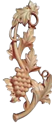
CRV5038 Grapevine Medallion 6" x 14 1/4" x 1"