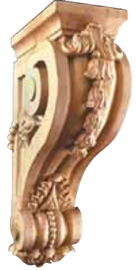
CRV5220 Large Bellflower Bracket 4" x 14 1/2" x 9 1/4"

Corbel dimensions are listed in order by width at widest point, overall height, and depth.