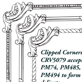
Clipped Corners CRV5079 accepts PM74, PM485, PM494 to form delicate decorative panels