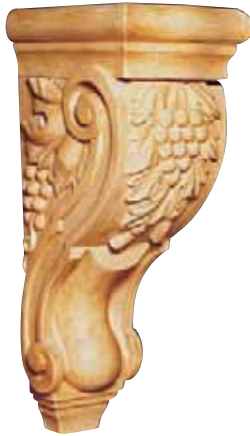
CRV5110 Large Grapevine Tassel 5 1/2" x 15" x 7"