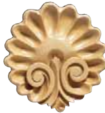
CRV5055 Shell Center 7 1/2" x 8" x 1"