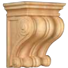
CRV5259 Classic Corbel 7" x 9" x 5 1/2"