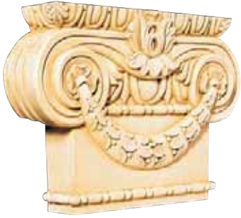
CRV5139 13" x 9" x 2 3/4" accepts up to 8" x 1 3/4"

Dimensions are listed in order by width at widest point, overall height, and depth.