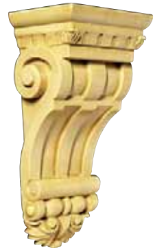
CRV5094 Medium Fluted 7" x 14" x 5 1/4"