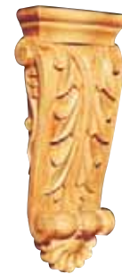
CRV5121 Medium Acanthus with Shell 4 1/2" x 10" x 1 3/4"