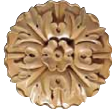
CRV5168 Lg Round Rosette 5" x 3/4" sold 2/card