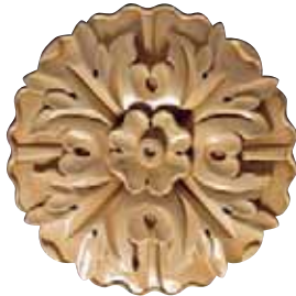
CRV5166 X-Lg Round Rosette 7" x 7/8"