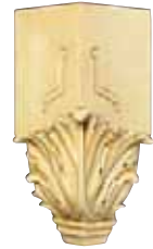
CRV5099 Small Crown Block 3 1/2" sq. x 8 1/2" Generally accepts crowns up to 5" wide