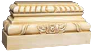
CRV5147 11 1/2" x 5 1/2" x 3 1/2" accepts up to 8" x 1 3/4"