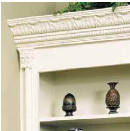
BREATHTAKING BOOKSHELVES - CM8812, CRV5125, PM8531