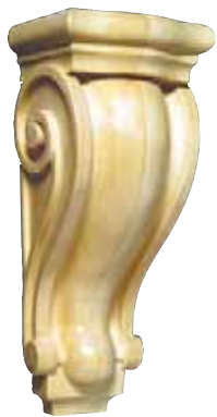
CRV5105 Classic 5 1/4" x 12 1/2" x 4 1/2"