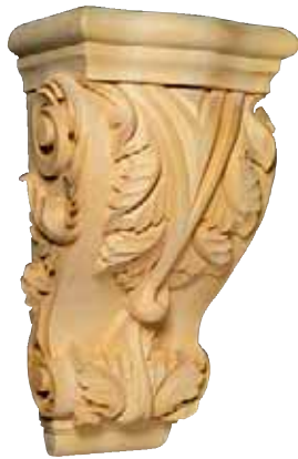
CRV5097 Large Acanthus 7 7/8" x 14 1/2" x 6"