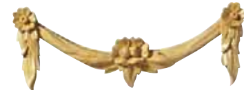
CRV5069 Large Floral Swag 16" x 6" x 1 1/2"