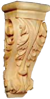
CRV5098 Medium Acanthus 5" x 12" x 4 1/2"