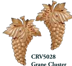
CRV5028 Grape Cluster 5" x 6 1/4" x 3/4" sold L and R pair per card