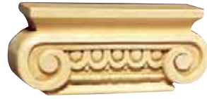
CRV5140 8" x 3 1/2" x 1 11/16" accepts 5 1/8" x 1 1/4"