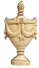
CRV5063 Small Urn 3 1/4" x 6 1/2" x 3/4"