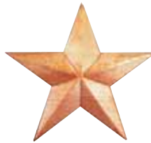
CRV5193 Medium Star 4" x 5/8" sold 4/card