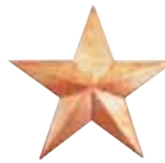
CRV5194 Small Star 2 1/2" x 1/2" sold 4/card