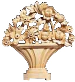
CRV5058 Flower Basket 10" x 10 1/2" x 1"