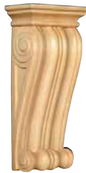
CRV5253 Classic Corbel 7" x 14" x 3 1/2"