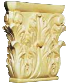
CRV5130 8" x 8" x 1 3/4" accepts up to 5 1/8" x 1 1/4"