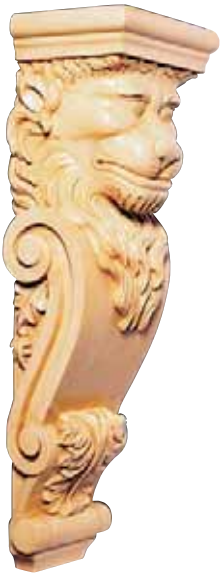
CRV5091 Lion's Head 8" x 26" x 6 1/2"