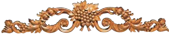
CRV5022 Medium Cluster with Scrolls 24" x 4 1/2" x 3/4"