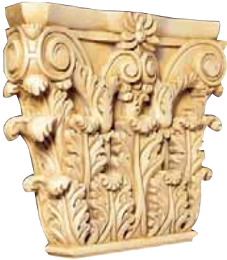
CRV5129 14 1/4" x 12" x 2 3/4" accepts up to 8" x 1 3/4"