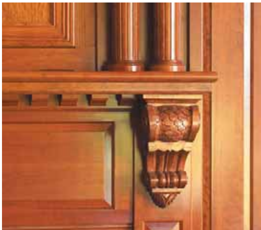
CORBEL - CRV5228

Slight variations occur during the handcarving process.