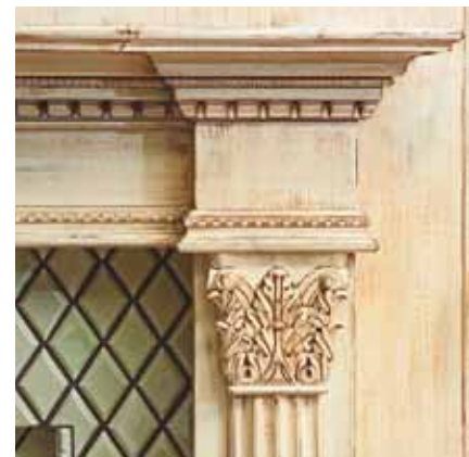
STATELY, BUT SIMPLE - PM593, CM75, PM73, PM593, CRV5130, CA328