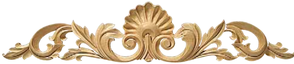
CRV5040 Large Shell with Scrolls - 36" x 7" x 7/8"