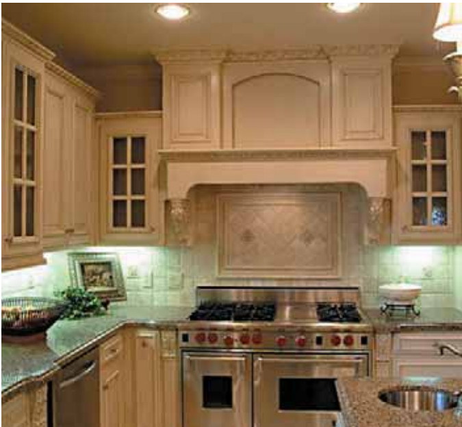
BEAUTIFUL STOVE HOODS - CM8810, CM8820, MLD5616, CRV5100, CRV5121