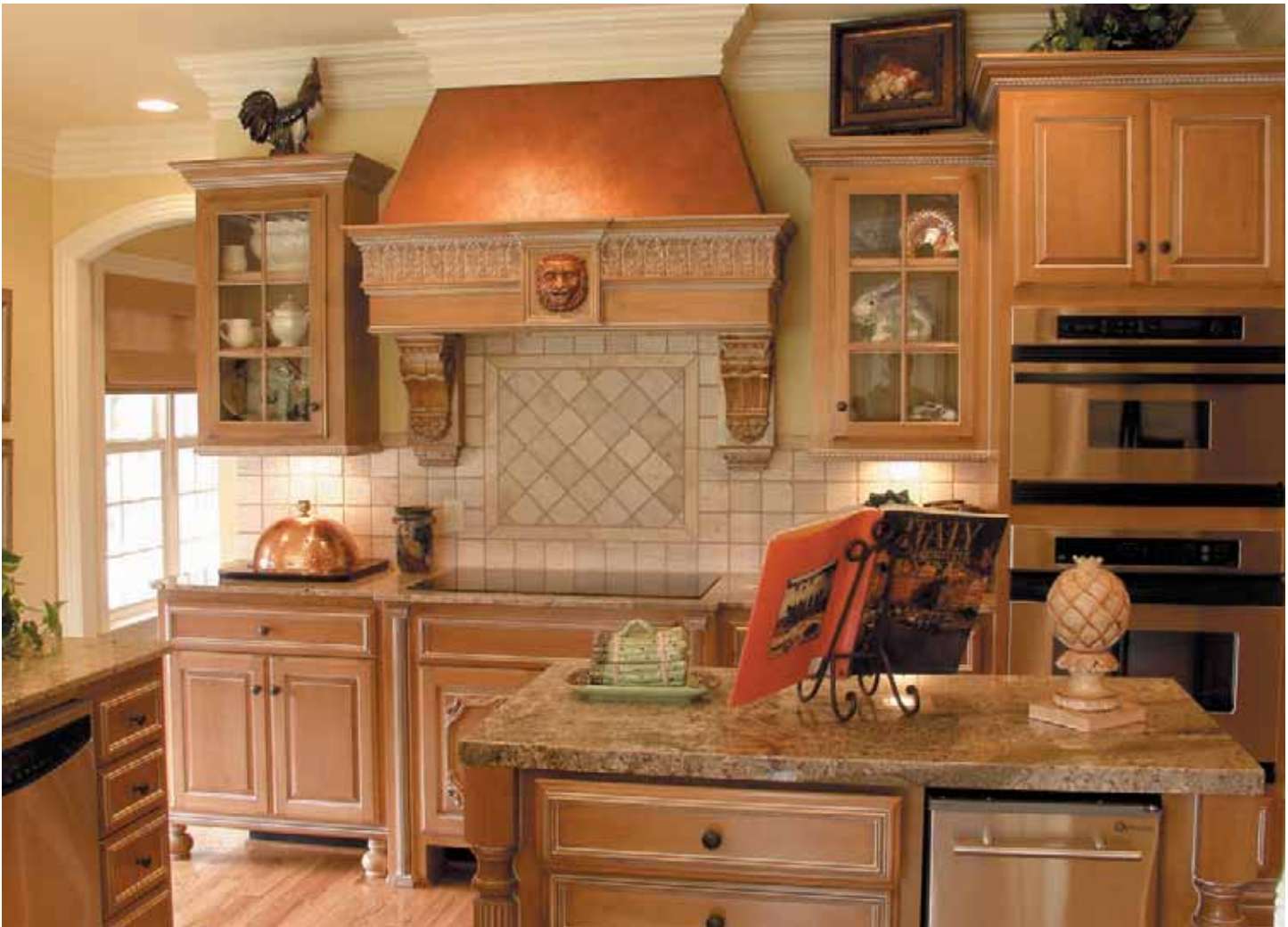
COZY KITCHEN - CM8860, FR8971, DS1x8 PM540, CRV5195, CRV5094 CRV5149, CRV5150, CRV5079 PM74, PM8565, FT6293