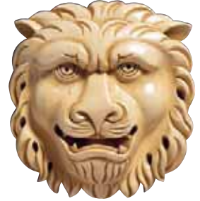
CRV5195 Lion's Head Rosette 6 1/2" x 7" x 1 1/2"

Slight variations occur during the hand carving process.