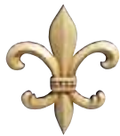
CRV5185 Med. Fleur de lis 3 1/2" x 4 1/8" x 1/2" sold 4/card