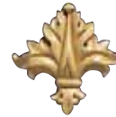
CRV5183 Sm. Acanthus Leaf 2 5/8" x 2 5/8" x 3/8" sold 4/card