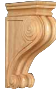
CRV5256 Classic Corbel 3 1/2" x 12" x 7 1/2"