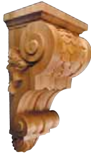
CRV5228 Large Imbricated Corbel 8" x 16" x 7"