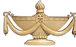
CRV5060 Large Urn 11" x 6 1/2" x 3/4"