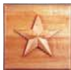
CRV5198 Small Star Rosette 3 1/2" sq. x 1 3/8" (Star is 2 1/2") Rosette accepts 13/16" casings sold 2/card

Dimensions are listed in order by width at widest point, overall height, and depth.