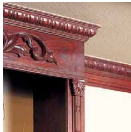
OAK CABINETRY - CRV5065, CRV5136, CM8823, PM8522, PM8552