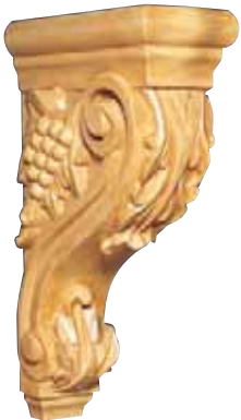
CRV5100 Acanthus Grapevine 3 1/2" x 13" x 8"