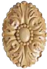
CRV5177 Lg. Oval Rosette 4 1/2" x 6 1/2" x 7/8"