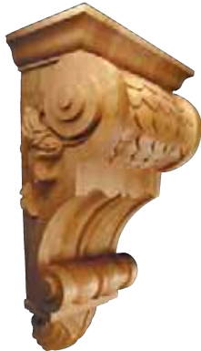
CRV5226 X-Large Imbricated Bracket Corbel 14" x 24" x 9"