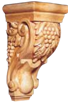
CRV5112 Medium Grapevine Tassel 4 3/4" x 10" x 5 1/4"