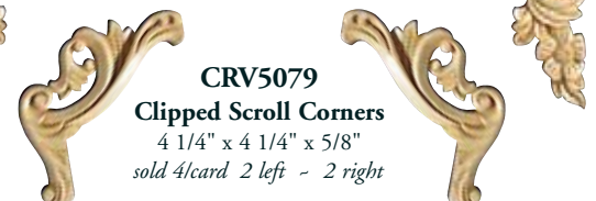
CRV5079 Clipped Scroll Corners 4 1/4" x 4 1/4" x 5/8" sold 4/card 2 left - 2 right