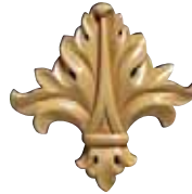
CRV5181 Med. Acanthus Leaf 3 7/8" x 3 7/8" x 1/2" sold 4/card