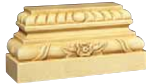
CRV5148 7 1/4" x 3 1/2" x 2 1/2" accepts up to 5 1/8" x 1 1/4"