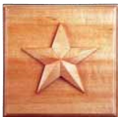
CRV5197 Medium Star Rosette 5 1/2" sq. x 1 3/8" (Star is 4") Rosette accepts 13/16" casings sold 2/ card