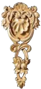
CRV5077 Shell & Floral Drop 4 1/2" x 10" x 5/8"

carvings are subject to design enhancements