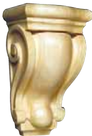
CRV5106 Classic 5 3/4" x 9 3/4" x 4 1/2"