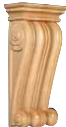
CRV5250 Classic Corbel 5" x 11" x 3"