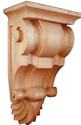
CRV5236 Large Fluted 9 1/4" x 16 1/2" x 6"