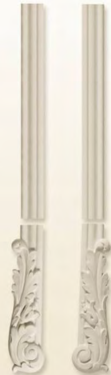
Molding #91176 Left & Right