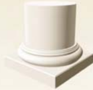
Single Bullnose with Plinth