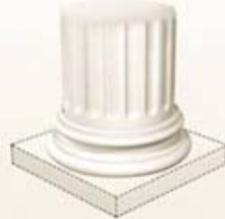
Double Bullnose (Plinth by others)