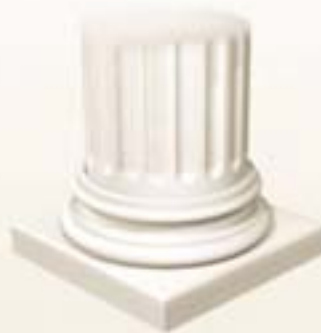
Double Bullnose with Plinth